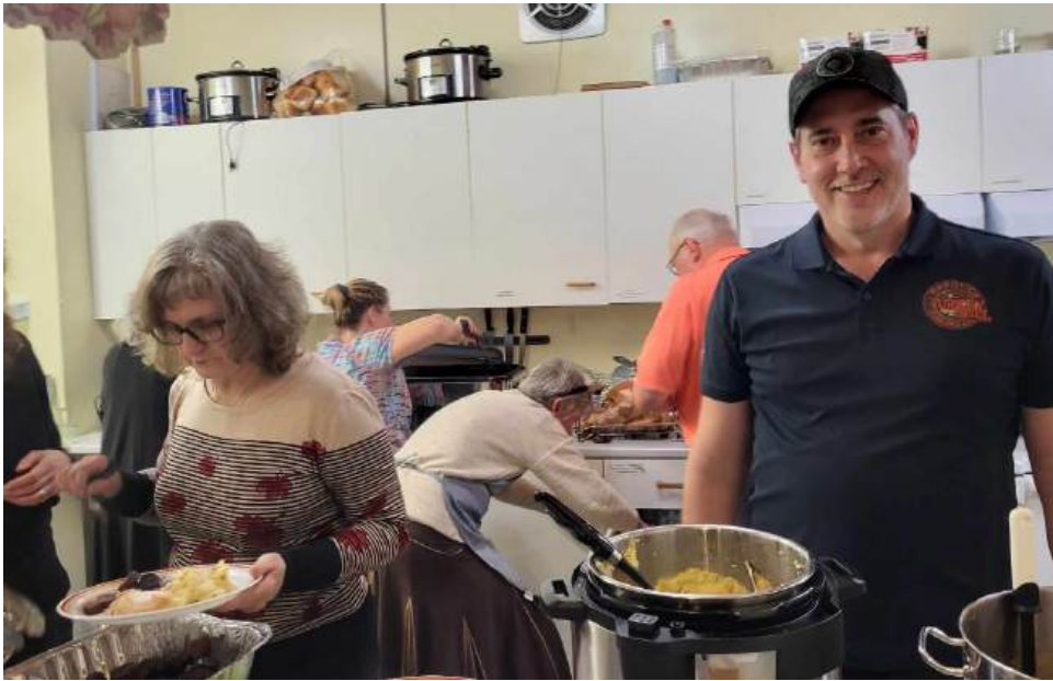
Thanks kitchen helpers!!