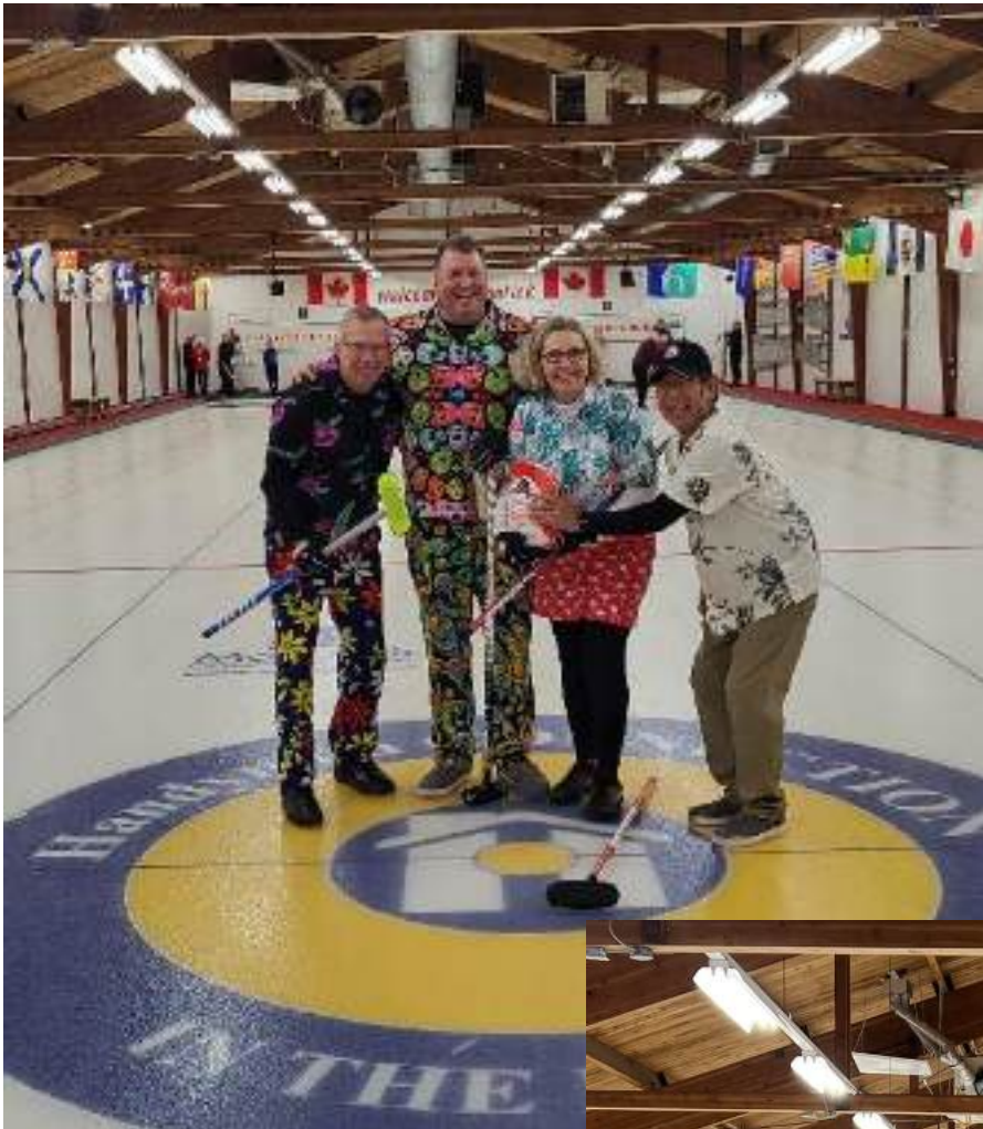
Team Fowler (great name, gobble, gobble)